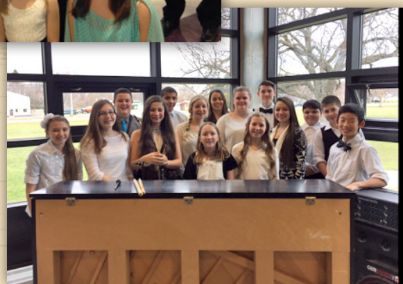
Holley MS All-County Band