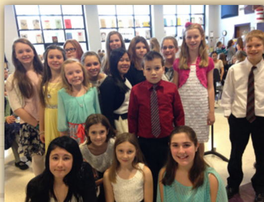
The following groups competed in the first All-County festival in Albion on Feb. 5-6: Holley Elementary All-County Chorus

Holley's Music Department is proud to announce that we will be hosting this year's All-County music festival in March. The program will include the elementary band, middle school chorus and high school band. Participating school districts include Holley, Kendall, Albion, Medina and Lyndonville. Our annual Orleans County Music Festival is a rewarding opportunity to showcase each district's top performing students in the areas of vocal and instrumental education. The students rehearse for two days with a guest conductor before performing in a Saturday afternoon concert. This year's festival is Saturday, March 5. The concert will begin promptly at 2 p.m. in the Holley MS/HS Auditorium. Tickets will be available through presale only, so as not to exceed our seating capacity.